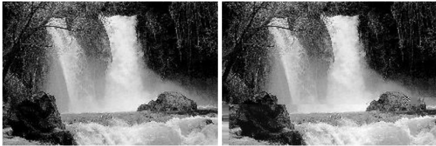
Fig. 3: The right picture was the original one and the left picture had deciphering inaccuracy.

baseline JPEG formula with 75% quality. The left image displays the original image that is a high-resolution photo of 1000*1000 pixels. The upper-right image reveals the JPEG formula in the white or black part. The lower-right image denotes the JPEG formula in the upper left corner of the black square. The volume of the black square is 200*200 pixels and the square wasn't associated to JPEG's 8*8 blocks. The JPEG file indicates the variance of size among the DC's coefficients of a preceding block associated to the present block. If a white or black part there are no variations in the coefficients' sizes. Six bits encrypted that kind of block by the JPEG standard [7].